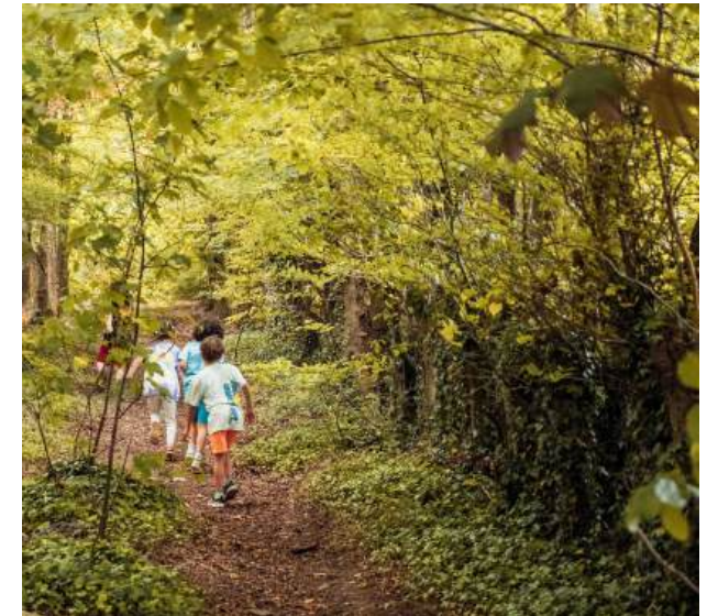
Stanmer Wellbeing Gardens

Three woodland spaces available to hire for regular events at Stanmer Wellbeing Gardens, in the heart of Stanmer Park. Perfect for those looking for a stress-free way to connect with nature in beautiful surroundings with convenient facilities.