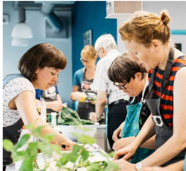
The Community Kitchen

Our central Brighton venue, ready to host exciting culinary experiences. The large dining table and well-equipped kitchen area makes it easy to host supper clubs, dinner parties, community bake offs, team building or entertaining clients.